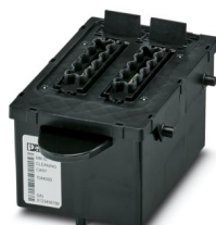
Replacement cleaning cartridge

https://www.phoenixcontact.com/us/products/1044350