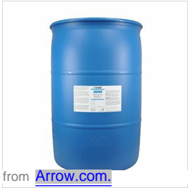
985M Soldering Flux