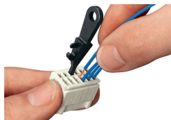
Conductor termination parallel to CAGE CLAMP® actuation