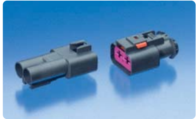
DCS Power 2 ways