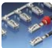
Power Terminal Systems