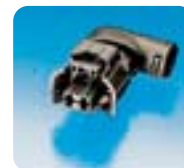
Sensors, Injectors & actuators