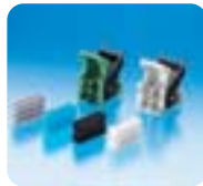
Convenience & Multimedia