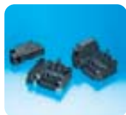
Active safety (ABS-ESP)