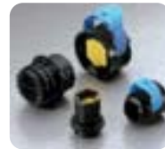
Modules (doors, seats)