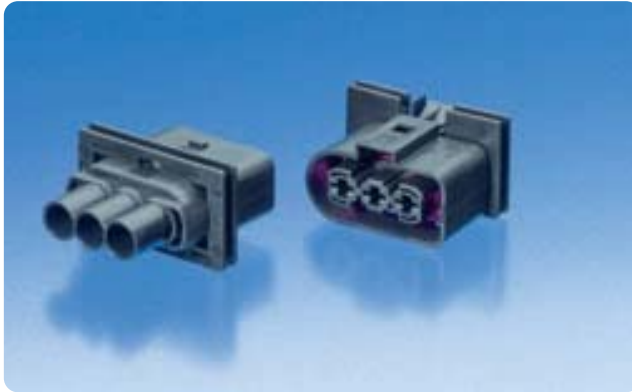
Power 3 ways