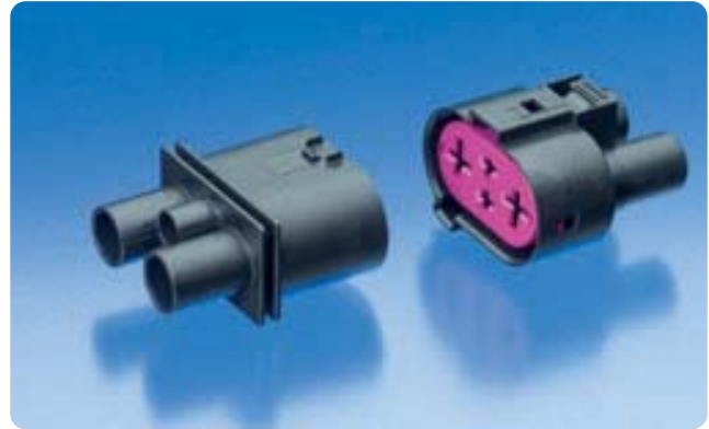
DCS Power 4 ways