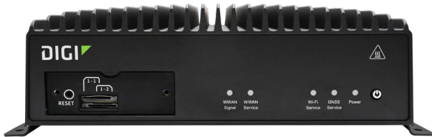
Digi TX54 — front