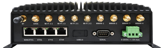
Digi TX54 dual Wi-Fi — back