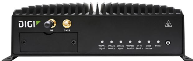
Digi TX54-2 dual cellular (PC 1.5) — front