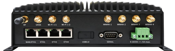
Digi TX54 — back