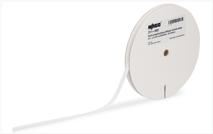
Color: white Similar to illustration