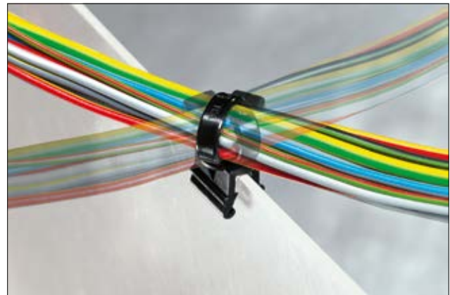
EdgeClip CBTO50R, rotatable 90°.