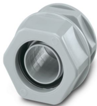
Cable gland made from PP with metric thread, IP65 protection

https://www.phoenixcontact.com/us/products/3240999