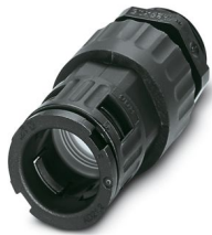
Cable gland, metric thread, IP68/69k protection, with strain relief

https://www.phoenixcontact.com/us/products/3240941