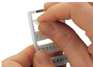
Separating a strip from the WMB or WMB marker card.