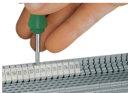
Snapping a WMB marker strip into the marker slot of the double marker carrier.