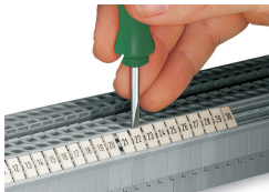
Snapping a marking strip into the marker slot.