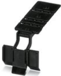
Universal wire holding bracket, perforated, for wiring channels

Please be informed that the data shown in this PDF Document is generated from our Online Catalog. Please find the complete data in the user's documentation. Our General Terms of Use for Downloads are valid ( http://phoenixcontact.com/download )