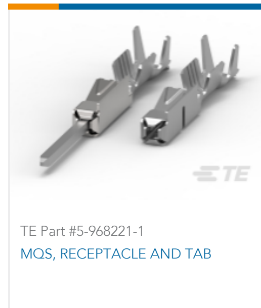
TE Part #5-968221-1 MQS, RECEPTACLE AND TAB