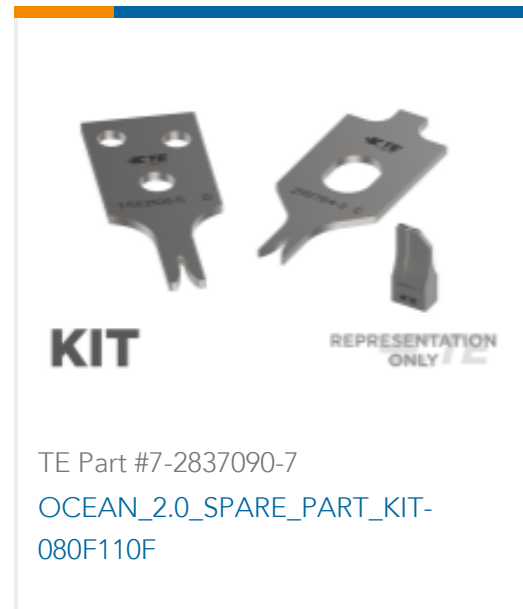
TE Part #7-2837090-7 OCEAN_2.0_SPARE_PART_KIT- 080F110F