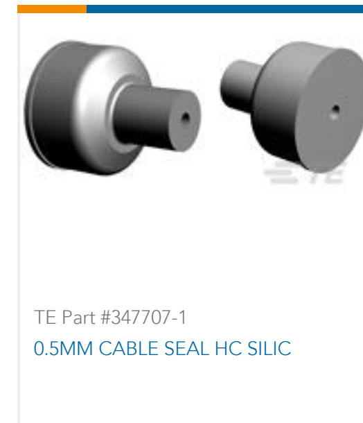
TE Part #347707-1 0.5MM CABLE SEAL HC SILIC