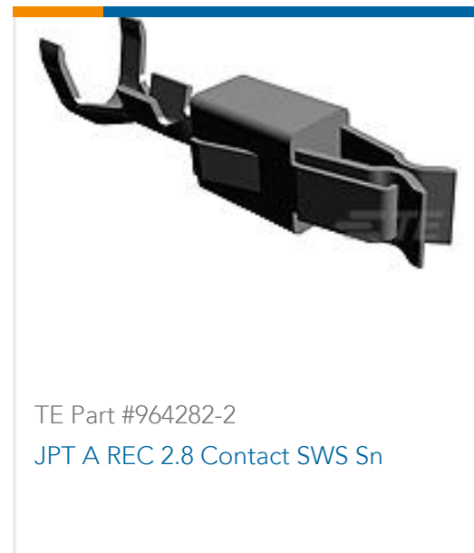
TE Part #964282-2 JPT A REC 2.8 Contact SWS Sn