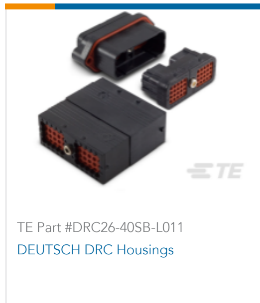
TE Part #DRC26-40SB-L011 DEUTSCH DRC Housings