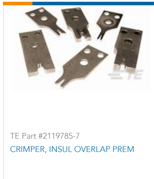
TE Part #2119785-7 CRIMPER, INSUL OVERLAP PREM