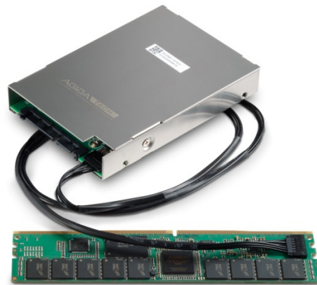
AGIGARAM 8GB DDR4 NVDIMM-N w/ PowerGEM supercap module in 2.5" drive form factor

AGIGARAM represents a new class of nonvolatile memory developed to meet the need for higher-performance persistent memory for enterprise-class storage and server applications. By combining industry-standard DRAM and NAND Flash technology, AGIGARAM provides the low latency and nearly infinite endurance of DRAM, along with the non-volatility of Flash. The AGIGARAM DDR4 Non-Volatile DIMM (NVDIMM) is designed to comply with the JEDEC-defined NVDMM-N type.