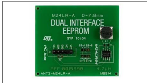
Figure 1. ANT3-M24LR-A block diagram

The reference board Gerber files are available from http://www.st.com .