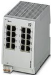
Managed Switch 2000, 16 RJ45 ports 10/100 Mbps, degree of protection: IP20, PROFINET Conformance-Class A

Please be informed that the data shown in this PDF Document is generated from our Online Catalog. Please find the complete data in the user's documentation. Our General Terms of Use for Downloads are valid ( http://phoenixcontact.com/download )