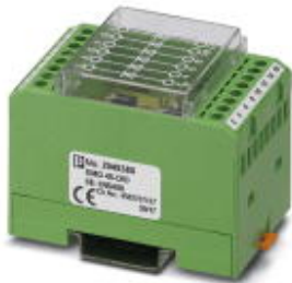
Diode module, with eight diodes, can be individually wired, diode type 1N 5408

Please be informed that the data shown in this PDF Document is generated from our Online Catalog. Please find the complete data in the user's documentation. Our General Terms of Use for Downloads are valid ( http://phoenixcontact.com/download )