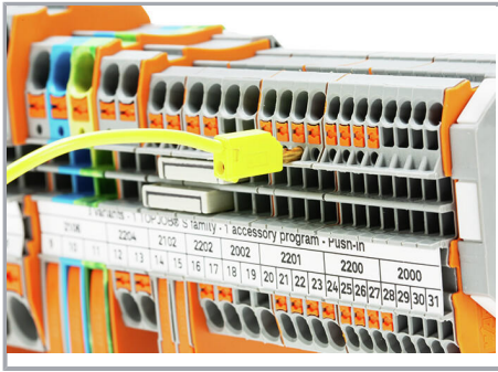
Testing with a 2.3 mm Ø test plug (max. 42 V).

Subject to changes. Please also observe the further product documentation!