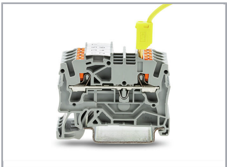
Testing with a 2.3 mm Ø test plug (max. 42 V).

Subject to changes. Please also observe the further product documentation!