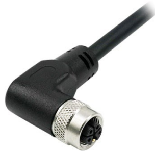
FEMALE FACE VIEW

(M12 Cordset, 5 Position, 16 AWG Unshielded, Female 90° to Free End)