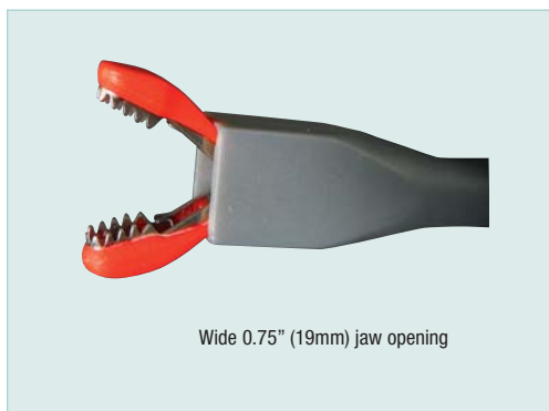
Wide 0.75" (19mm) jaw opening