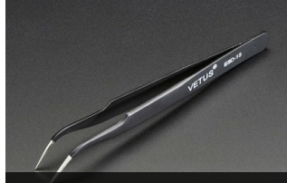
Fine tip curved tweezers -