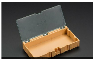
Large Modular Snap Box -