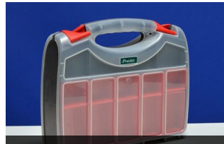
Large Double-Sided Storage