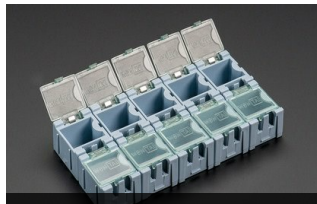
Tiny Modular Snap Boxes -