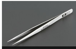
Precision Straight Tweezers