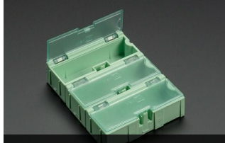
Small Modular Snap Boxes -