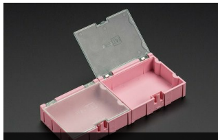
Medium Modular Snap