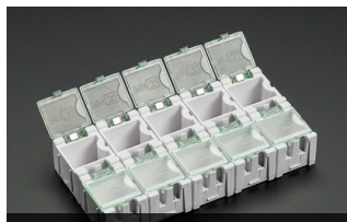
Tiny Modular Snap Boxes -