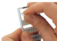
Separating a strip from the WMB or WMB marker card.