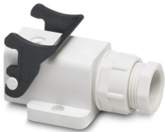
HEAVYCON D7 box mounting base, with single locking latch, height 25.5 mm, with 1 x Pg11 screw connection, with open bottom, zinc

Please be informed that the data shown in this PDF document is generated from our online catalog. Please find the complete data in the user documentation. Our general terms of use for downloads are valid.