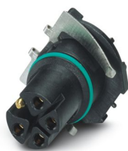
Contact carrier, Power, 5-position, Socket, straight, M12, coding: K, PCB mounting, THR solder connection

Please be informed that the data shown in this PDF document is generated from our online catalog. Please find the complete data in the user documentation. Our general terms of use for downloads are valid.