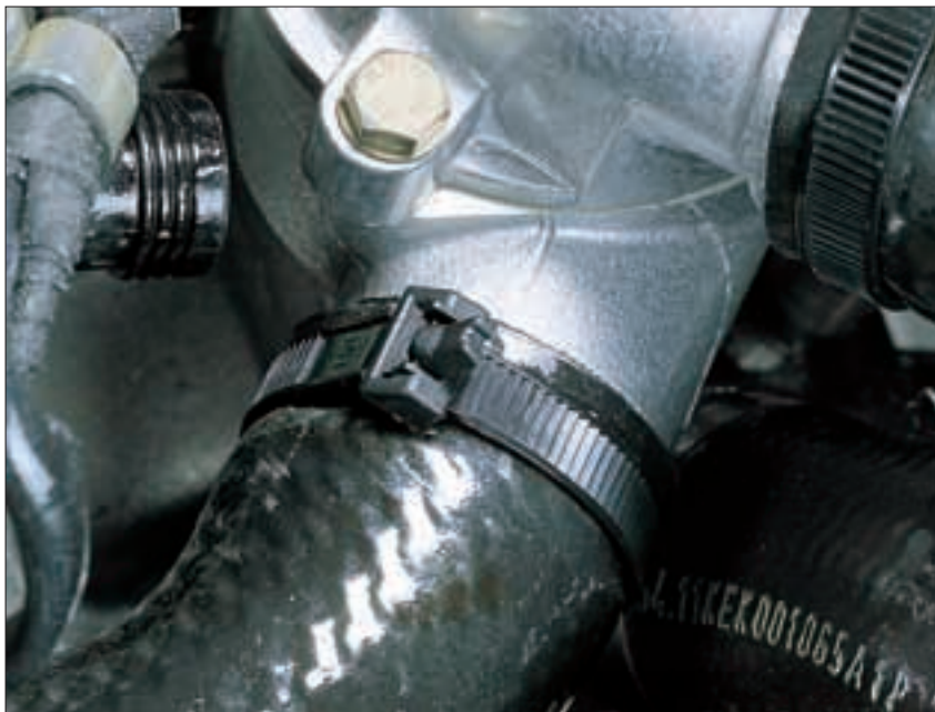
RT250 tie used as a hose fixing in a car engine compartment.

These releasable and reusable cable ties are ideal for temporary or permanent installation in a wide variety of applications in industries as diverse as: automotive, construction and panel building.