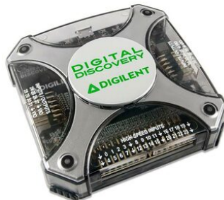
Digilent Digital Discovery: Portable USB Logic Analyzer and Digital Pattern Generator