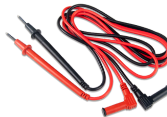
Digilent DMM Probes: Digital Multimeter Test Leads $8.99