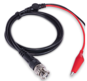
Digilen BNC to Alligator C Cable $8.99