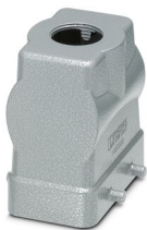
HEAVYCON sleeve housing B10, for double locking latch, height 72 mm, with thread 1x M25, straight conductor exit

Please be informed that the data shown in this PDF document is generated from our Online Catalog. Please find the complete data in the user documentation. Our General Terms of Use for Downloads are valid.