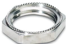
EMV nut, Threads, Pg9

Please be informed that the data shown in this PDF document is generated from our Online Catalog. Please find the complete data in the user documentation. Our General Terms of Use for Downloads are valid.