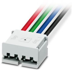
Assembled PCB connector

https://www.phoenixcontact.com/us/products/1707561