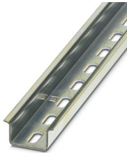
DIN rail perforated, Pack of 25 (50 m), similar to EN 60715, material: Steel, galvanized, passivated with a thick layer, Standard profile, color: silver

Please be informed that the data shown in this PDF document is generated from our online catalog. Please find the complete data in the user documentation. Our general terms of use for downloads are valid.