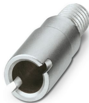
Test plug strip, number of positions: 1, color: silver-colored

Please be informed that the data shown in this PDF document is generated from our online catalog. Please find the complete data in the user documentation. Our general terms of use for downloads are valid.