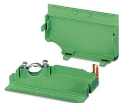
Cable housing, product range: KGS-MSTB 2,5

Please be informed that the data shown in this PDF document is generated from our online catalog. Please find the complete data in the user documentation. Our general terms of use for downloads are valid.