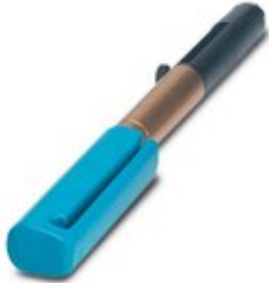
Contact removal tool, for turned and rolled CK- 1.6-... contacts

Please be informed that the data shown in this PDF Document is generated from our Online Catalog. Please find the complete data in the user's documentation. Our General Terms of Use for Downloads are valid ( http://phoenixcontact.com/download )