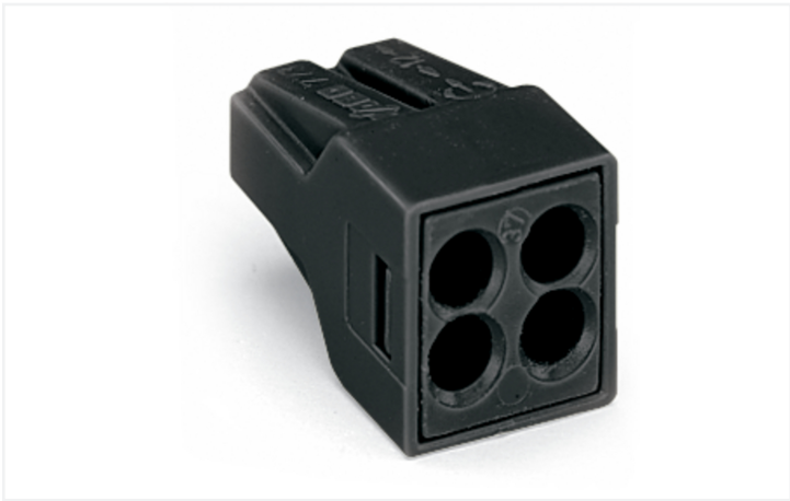
Color: ■ black