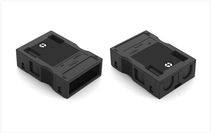
Color: ■ black