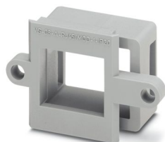
RJ45 panel mounting frame, 1x, IP20, for modular socket inserts (Keystone), without mounting screws

Please be informed that the data shown in this PDF document is generated from our online catalog. Please find the complete data in the user documentation. Our general terms of use for downloads are valid.