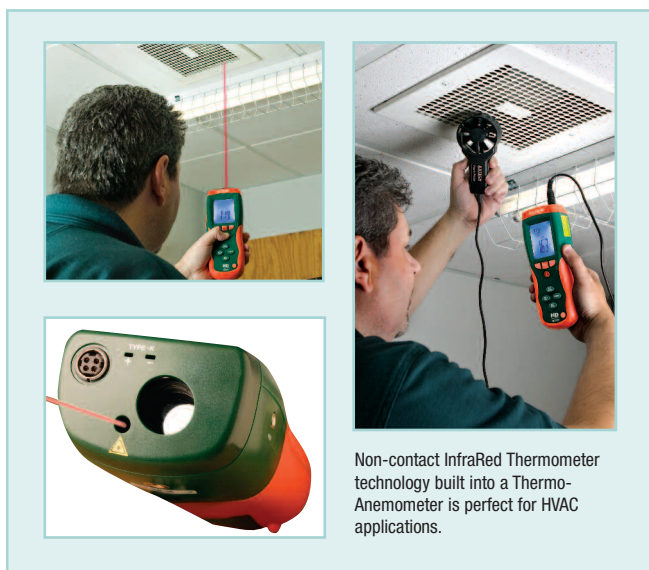
Non-contact InfraRed Thermometer technology built into a Thermo-Anemometer is perfect for HVAC applications.