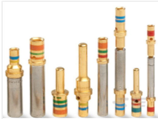
TE Part #ZPF0000000000003628 724-1064-16