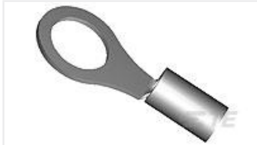
TE Part #323173 STRATO-THERM, HR 4 1/4 NIPL