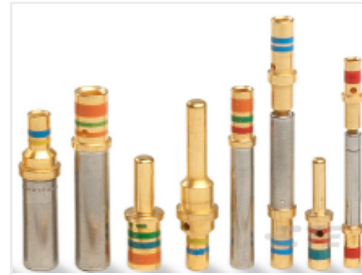
TE Part #ZPF0000000000000570 020-0511-20