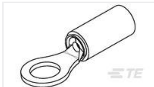
TE Part #1577633-1 TERMINAL RT PIDG PEEK STRATO 18-16 AWG