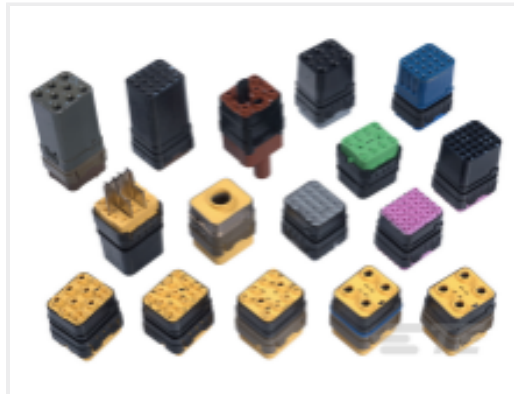
TE Part #ZPF000000000015299 DMC-M 20-22 BN