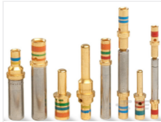
TE Part #ZPF0000000000000568 020-0511-12