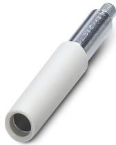
Female test connector, color: white

Please be informed that the data shown in this PDF document is generated from our Online Catalog. Please find the complete data in the user documentation. Our General Terms of Use for Downloads are valid.