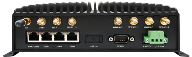
Digi TX54 — back