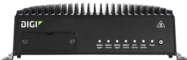
Digi TX54 dual cellular — front