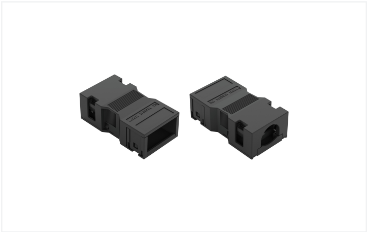
Color: ■ black