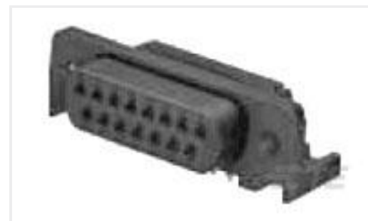
TE Part #5745394-2 HD-20 RCPT 9P RA 318 THD INS