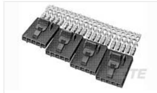
TE Part #103957-5 4X6 MTE RCPT SR LATCH .100CL