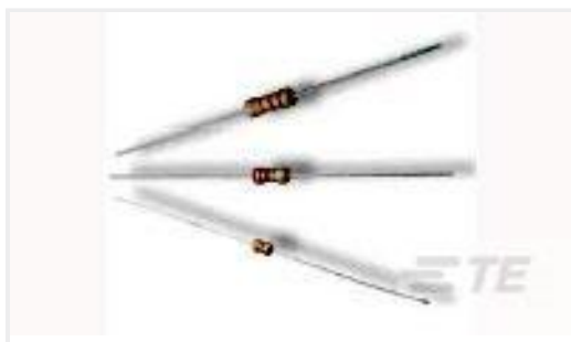
TE Part #1623927-1 CFR16 5% 100K