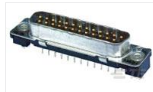
TE Part #2-5747704-0 25 PLUG SP/FMS BRDLK