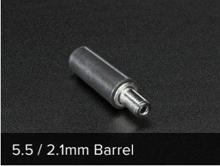
5.5 / 2.1mm Barrel