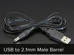
USB to 2.1mm Male Barrel