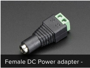
Female DC Power adapter -