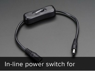
In-line power switch for