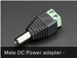
Male DC Power adapter -