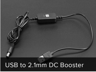
USB to 2.1mm DC Booster