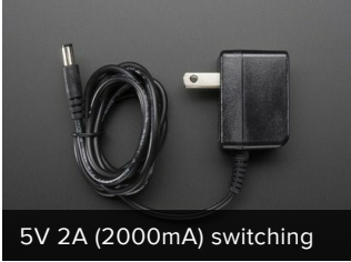
5V 2A (2000mA) switching