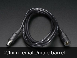
2.1mm female/male barrel