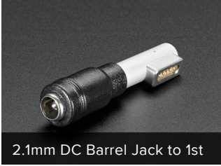
2.1mm DC Barrel Jack to 1st