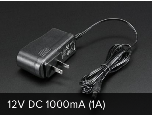
12V DC 1000mA (1A)