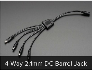
4-Way 2.1mm DC Barrel Jack