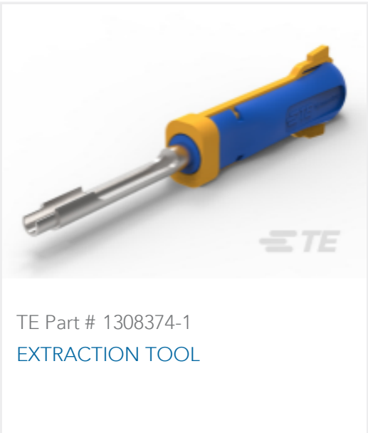
TE Part # 1308374-1 EXTRACTION TOOL