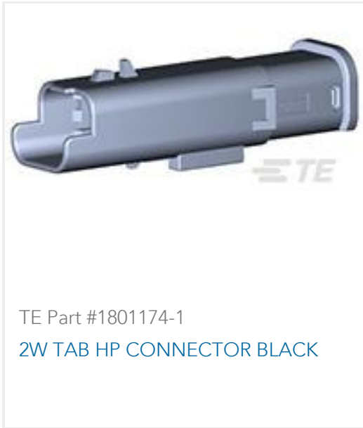
TE Part #1801174-1 2W TAB HP CONNECTOR BLACK