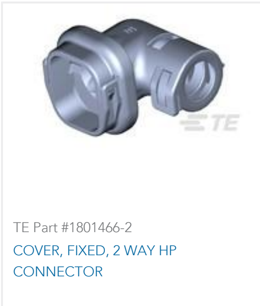
TE Part #1801466-2 COVER, FIXED, 2 WAY HP CONNECTOR