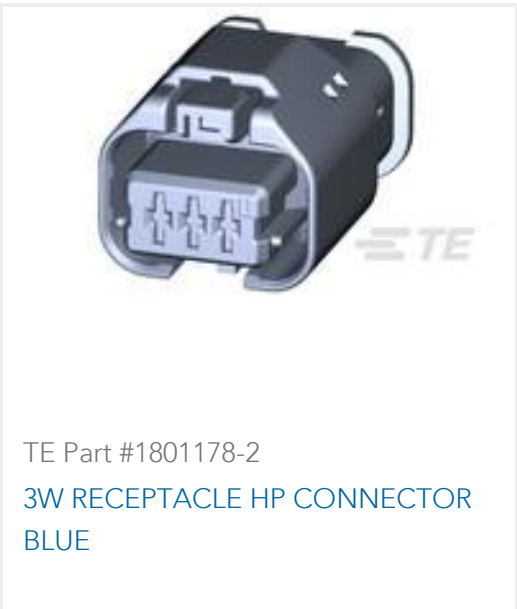
TE Part #1801178-2 3W RECEPTACLE HP CONNECTOR BLUE