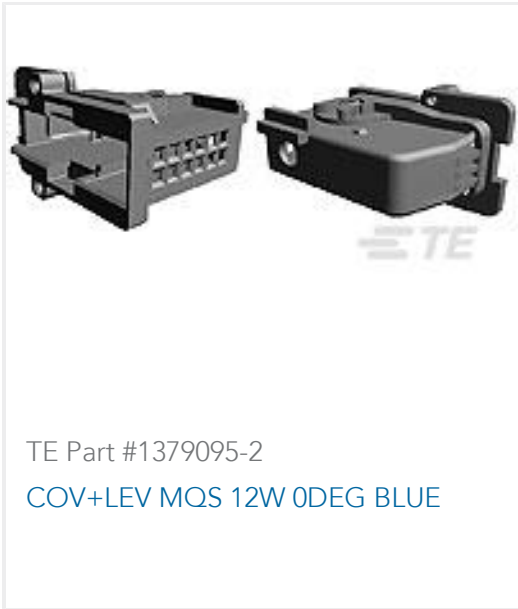
TE Part #1379095-2 COV+LEV MQS 12W 0DEG BLUE