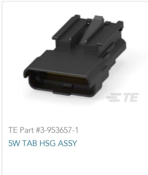
TE Part #3-953657-1 5W TAB HSG ASSY