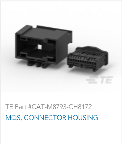
TE Part #CAT-M8793-CH8172 MQS, CONNECTOR HOUSING