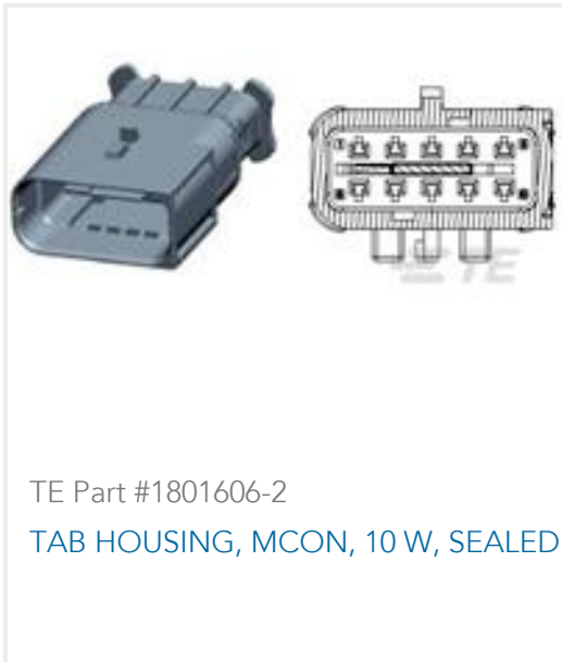
TE Part #1801606-2 TAB HOUSING, MCON, 10 W, SEALED