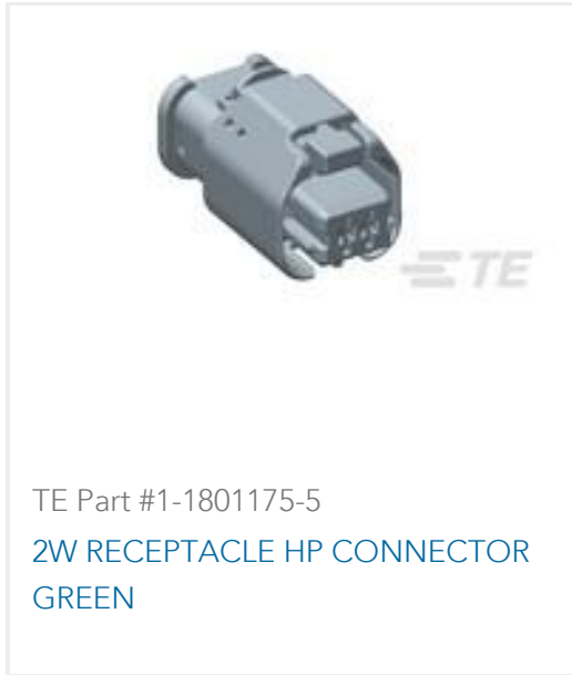
TE Part #1-1801175-5 2W RECEPTACLE HP CONNECTOR GREEN