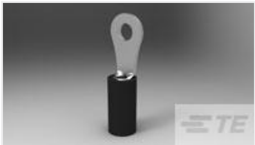
TE Part #151458 TERMINAL R T PIDG NYL AWG 22 #