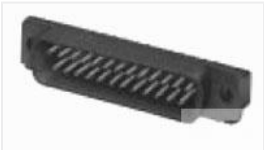
TE Part #5208008-2 HD-20 PLUG 25P VERT