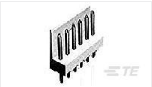
TE Part #173081-6 6P EIS POST HDR ASSY