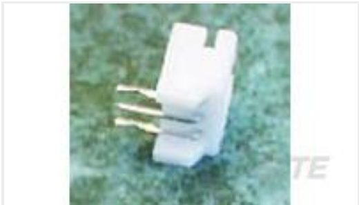
TE Part #440055-4 2.0MM,HDR,4POS,R/A