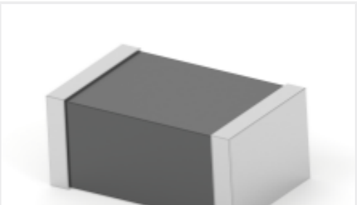
TE Part #2176487-1 BMC 0805 300R 25% A Med C