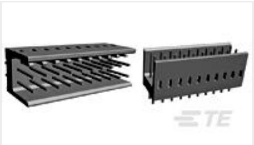
TE Part #826469-6 2X6P MOD II SHROUDED HEADER, ST