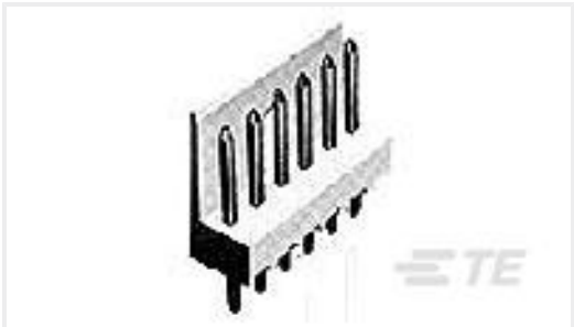
TE Part #173081-3 EIS POST ASSY V 3P GOLD NATU.