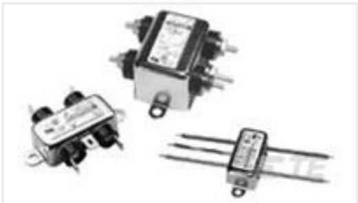
TE Part #6609021-6 3VB3=F7125 S0