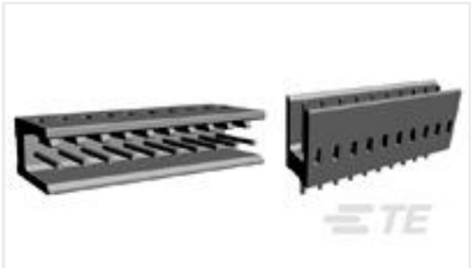
TE Part #826467-6 6P MOD II SHROUDED HEADER, ST