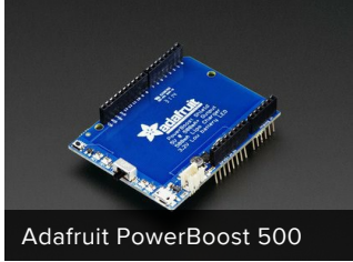
Adafruit PowerBoost 500