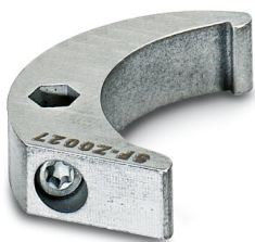
Hook wrench, series: RC

https://www.phoenixcontact.com/us/products/1607455