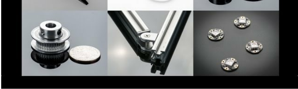
Aluminum GT2 Timing Pulley - 6mm Belt - 20 Tooth - 8mm Bore ( 13:20 )