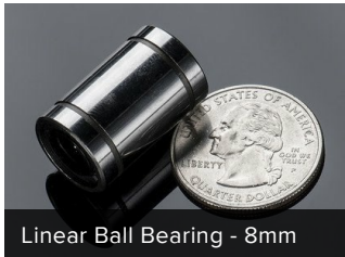
Linear Ball Bearing - 8mm