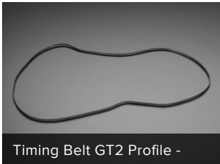
Timing Belt GT2 Profile -