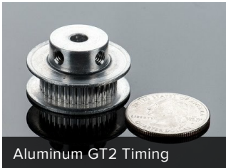
Aluminum GT2 Timing