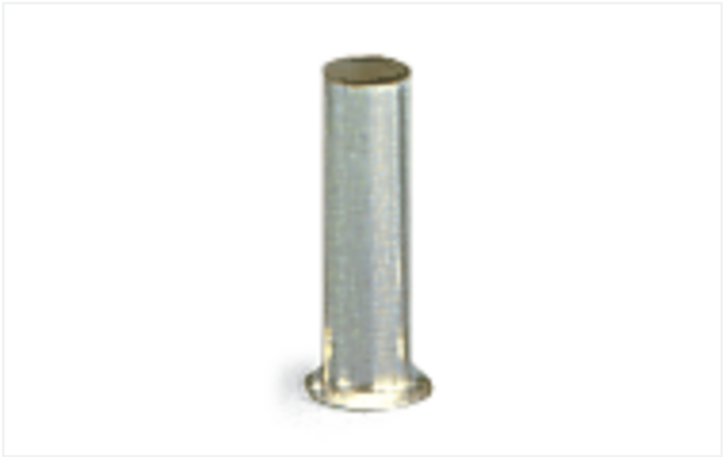
Color: ■ silver-colored