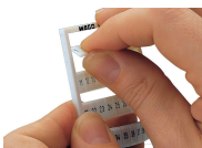
Separating a strip from the WMB or WMB marker card.