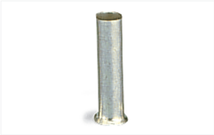
Color: ■ silver-colored