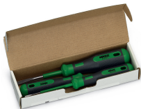
Set of operating tools in a box